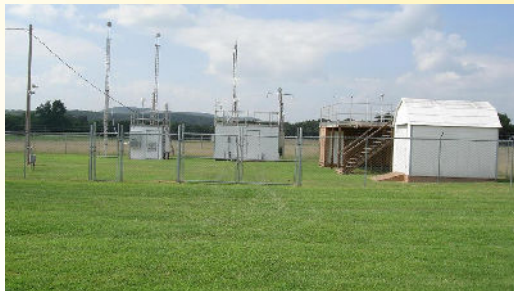
Site ID: C4 AQSID: 40-001-9009 Site Name: Stilwell

Map created 10/19/2020 ETD Map Disclaimer: Information on this map is from multiple sources and is to be used for graphic display and general planning purposes only. Data accuracy cannot be guaranteed. Questions about this map, its sources, and intended use should be directed to the Cherokee Nation GeoData Center.