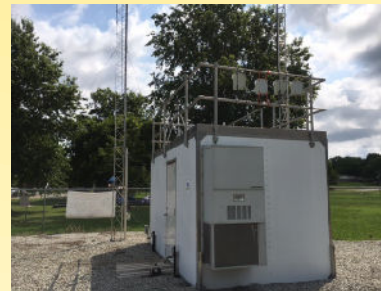
Site ID: C6 AQSID: 40-097-9014 Site Name: Pryor