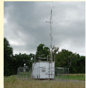
Site ID: C13 AQSID: 40-135-9021 Site Name: Roland